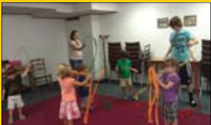
Fun with Music and ribbon sticks!